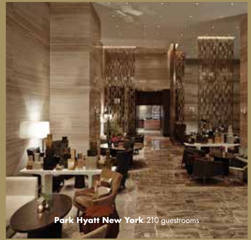
Park Hyatt New York 210 guestrooms