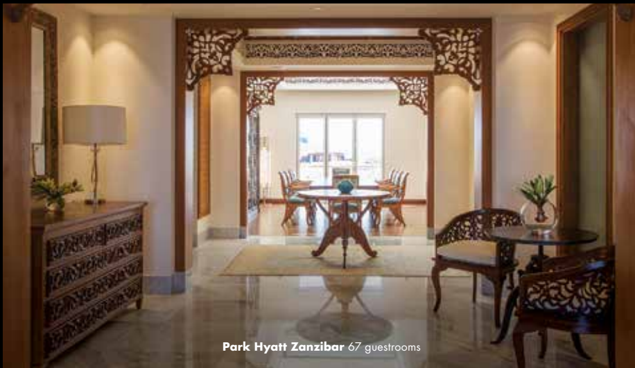
Park Hyatt Zanzibar 67 guestrooms