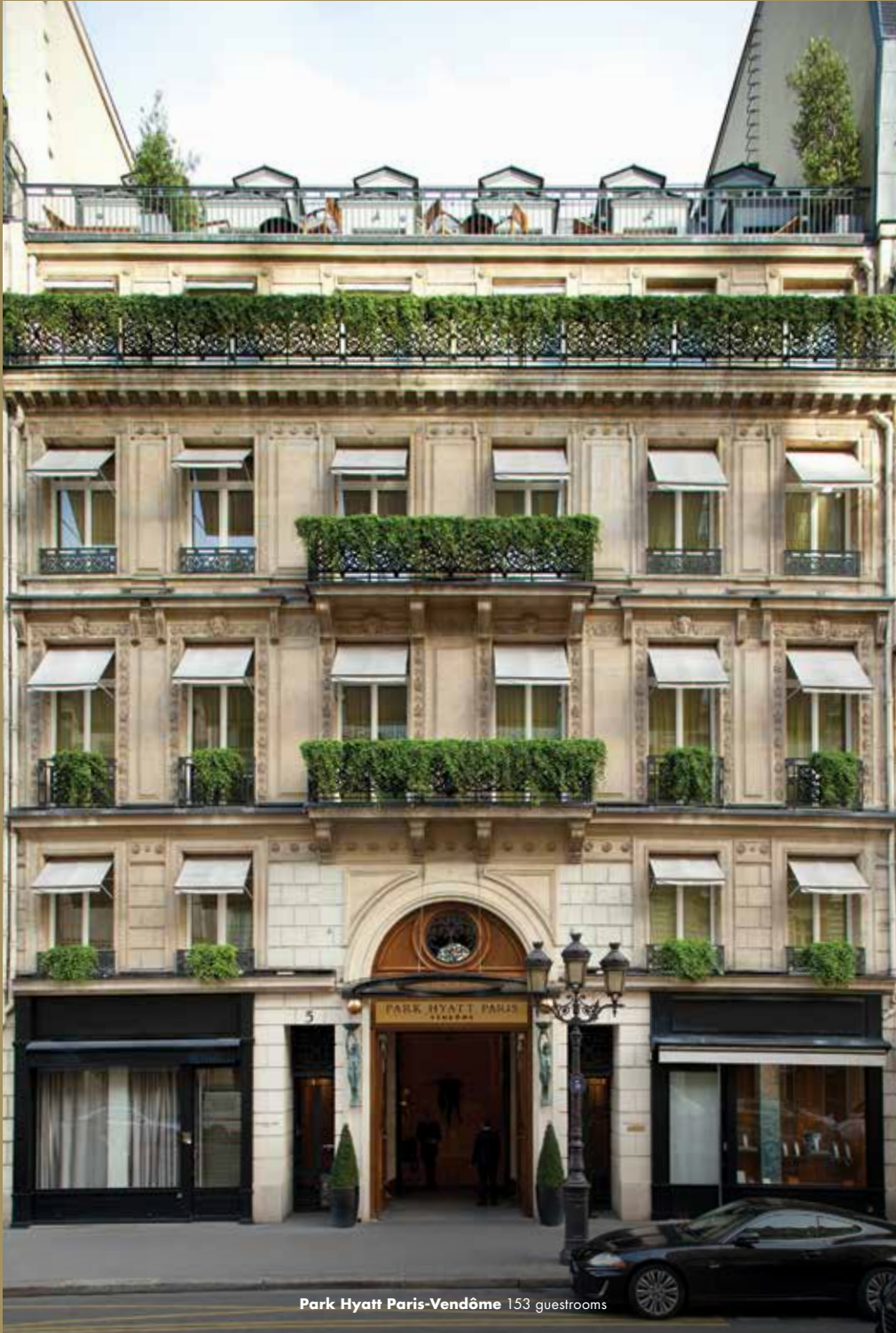
Park Hyatt Paris-Vendôme 153 guestrooms